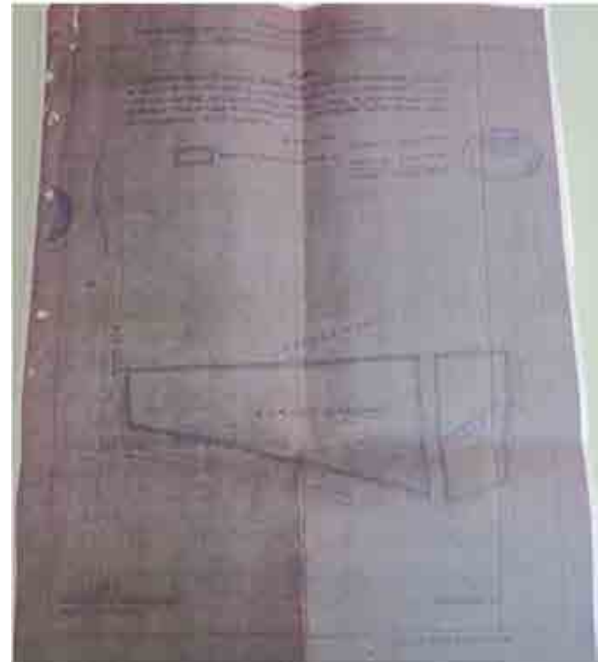
PLAN OF PLOT AREA 22,775 SQMT