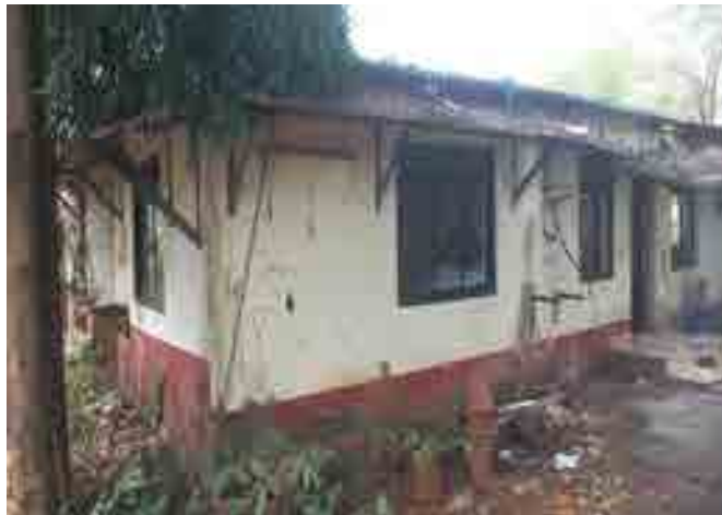
Office Block (Admin Building)